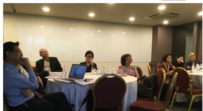
Interaction between speakers and participants