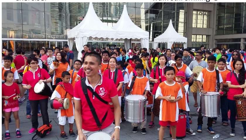
End of the Walk, percussion players with the drums and kompangs.