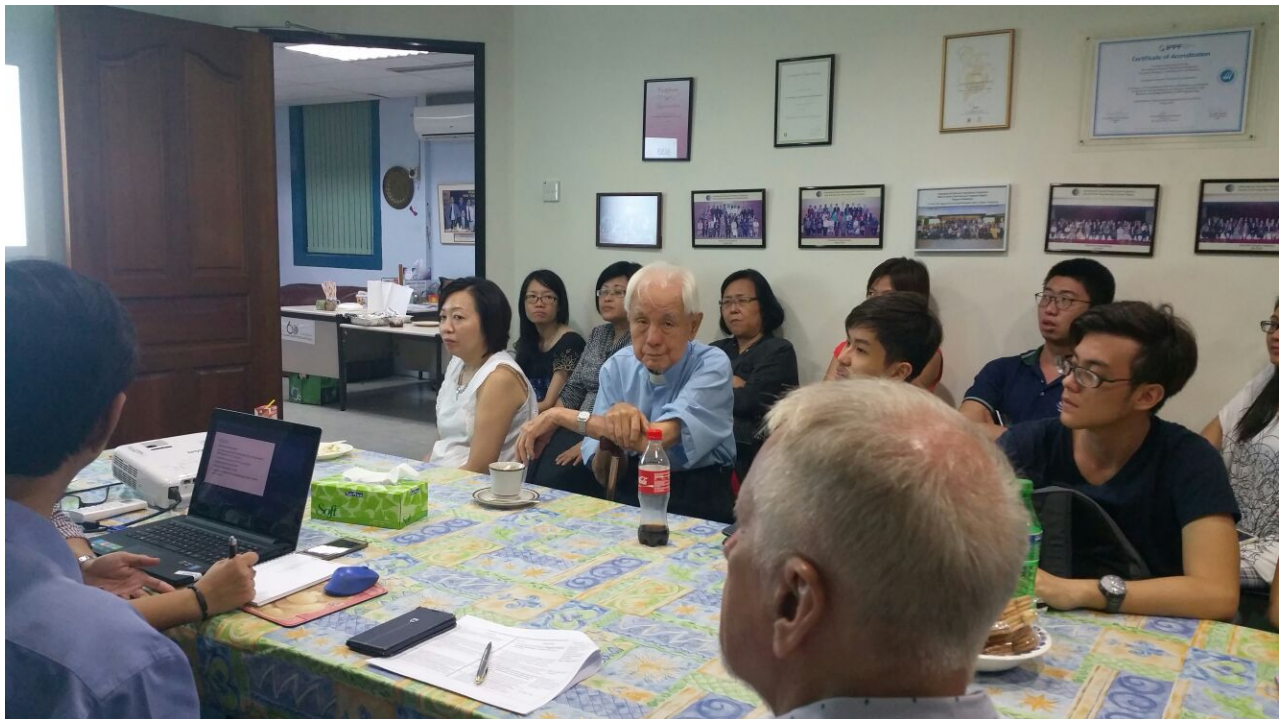
Picture shows some of the senior and junior members who were present at the EGM.